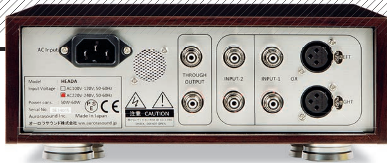
ABOVE: Input 1 offers balanced or unbalanced connections while Input 2 is unbalanced only. 'Through Output' bypasses the volume control, so the Heada cannot serve as a preamp with a separate power amp

From my days of owning the LP, I'd always thought that Communiqué was the best sounding of the early Dire Straits albums, certainly much better than Making Movies , but never felt that I'd really extracted the best from it. With the recent arrival of the DSD-layer-only SACD from Japan I feel I've finally got there: as close to the master tape as I'm ever likely to get.